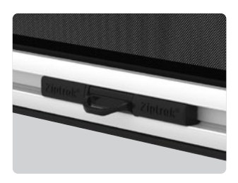
Front Handle Lock your blind in place when fully down (closed).

Centre-Lock-Release Mechanism (exclusive for manual operation)