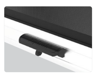
Reverse Handle Add an extra handle to unlock the blind from the other side.